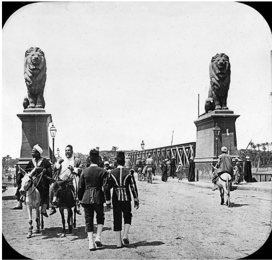
←fig. 2 Unknown photographer, The Old Geizira Bridge in Egypt , ca. 1880. Hand tinted silver gelatine photograph.

It is here that I wonder how the exhibition would have changed if it was Islamicate in intention. With a transcultural historiography of photography being an objective of the show, what types of histories could have been brought to the fore if hand-painted photography were examined within other “similar yet dissimilar” locales as well? Take for instance hand-painted photography in Egypt. (fig. 2) The Middle East played a critical role in the development of photography both as a new technology and as an art form. Many European photographers travelled to the Middle East to amass portfolios of Egyptian antiquity, sites of holy lands, and the exotic Other, making the region one of the principle training grounds for the early practice of photography. 28 What could the development of the photographic medium in a site such as Egypt offer to the development of photography in India? With Egypt being colonized by the French in 1798, and later enduring British occupation in 1882, colonialism and its interlocutors could be seen as a powerful link between the vastly different regions. While India has had a longer and more vexed relationship with colonization, being imperially under Dutch, Danish, French, British, and Portuguese rules, India was under British rule during the period photography was invented and developed. Therefore, the technological development of photography during